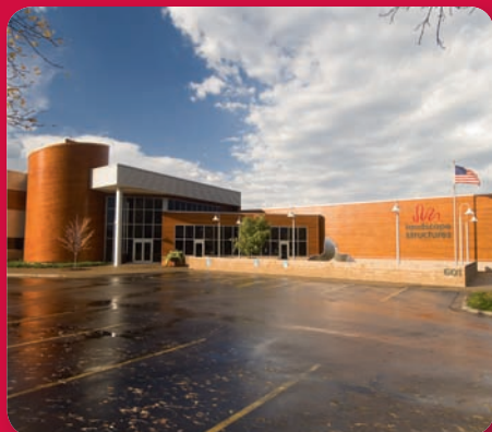
Our corporate headquarters