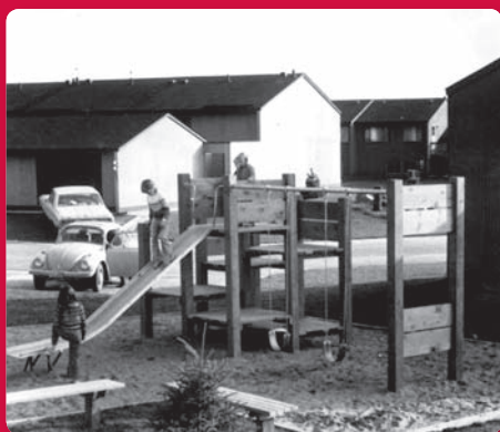
The first LSI structure