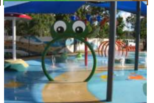
Projects completed by Playscape Creations