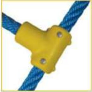
Tee Joint Connector