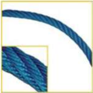
16mm Multi-filament Polypropylene Rope