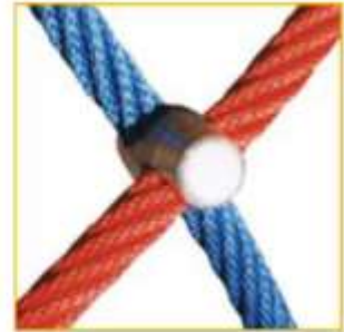
Heavy Duty Aluminium Rope Connector