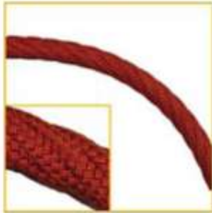
16mm Braided Nylon Rope