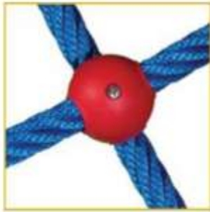
Standard Rope Connector