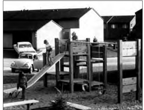
The first Landscape Structures playstructure